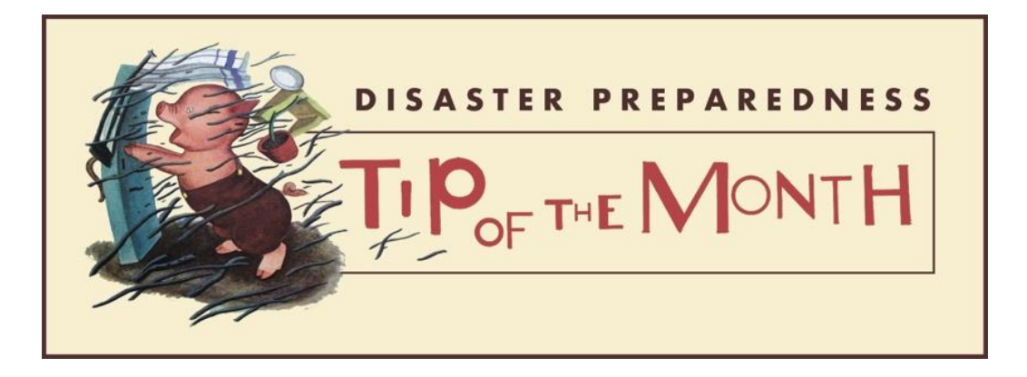
JUNE 2021 – TIP OF THE MONTH #10 From the GHNA Disaster Preparedness Committee